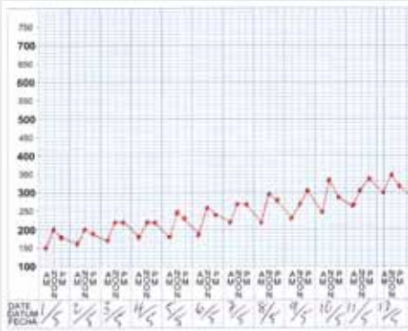
Peak flow record chart showing recovery from acute asthma with pronounced morning dips.