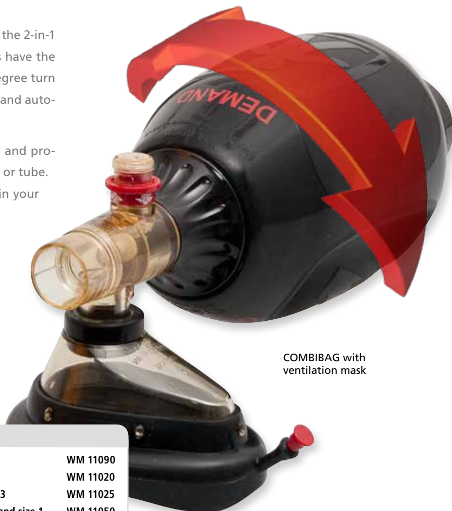
COMBIBAG with ventilation mask

The safety valve limits the ventilation pressure and protects the patient during ventilation with a mask or tube. With COMBIBAG you save time, free up space in your emergency case and save on costs.