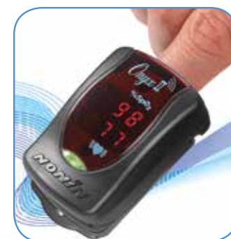
Onyx® II, Model 9560 - The World's First Bluetooth® Wireless Fingertip Pulse Oximeter

The Onyx II, Model 9560 with Bluetooth wireless technology is designed with our proven PureSAT® oximetry technology and delivers the trusted, precision accuracy of the entire Onyx line. And now with the advantage of wireless monitoring capabilities — the built to last and easy-to-use Onyx II 9560 provides unparalleled versatility for patient and clinician. Plus, with the addition of innovative new features such as Extended Range and Power Saver — it's ideal for home patient use.