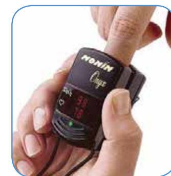
Onyx®, The World's First Fingertip Pulse Oximeter

The Nonin Onyx is the most widely used and trusted fingertip pulse oximeter by clinicians and patients worldwide. The Onyx is a proven performer with the widest range of patients from pediatric to adult, light to dark skin tones and good to low perfusion. The accuracy of Onyx fingertip oximeters is a result of Nonin Medical's superior PureSAT® signal processing technology that removes noise, artifact and/or interference that may affect readings — providing consistently accurate oximetry readings you can depend on.