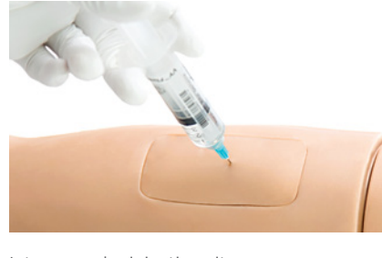
Intramuscular injection site