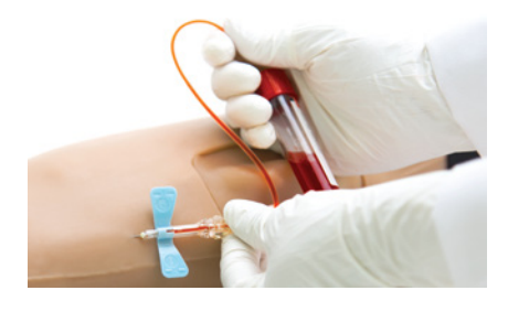
Arterial and venous blood sampling

Gaumard's S.M.A.S.H. Advanced Patient Training arm was first introduced in 1986. The latest improvement to this "world class" standard offers realism in a sleek design. A micropump mounted within the simulator's shoulder delivers automatically generated arterial pulses at the radial and brachial sites and controls arterial blood flow by allowing variable heart rate and pulse strength. Interchangeable arterial and venous inserts within the forearm allow creation of arteriovenous (AV) fistulas and placement of AV grafts, while a simulated healed fistula insert provides a platform on which hemodialysis exercises can be performed. An additional multi-layer insert in the bicep area can be used for incision and suture training exercises.