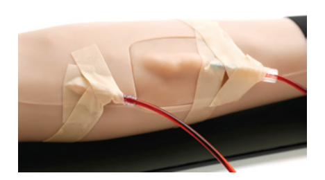
Hemodialysis exercises on simulated healed fistula