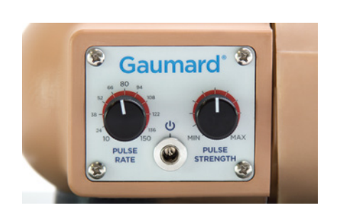
Micropump-controlled arterial system provides variable pulse rate and pulse strength