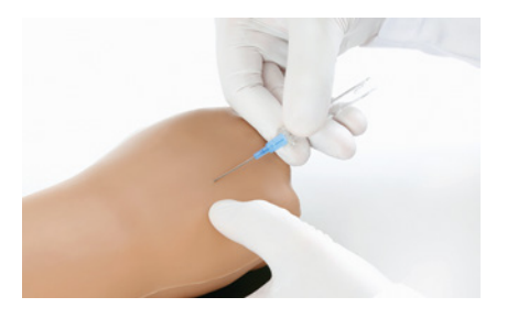
IV exercises on dorsum of hand