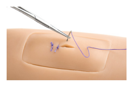
Suture and incision sites on the upper arm and forearm