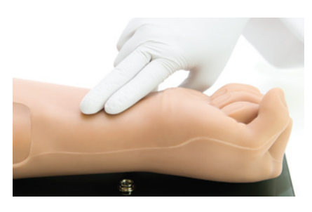
Arterial system providing palpable radial pulse